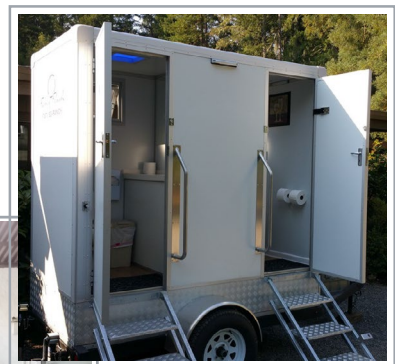
VIP TRAILER TOILETS